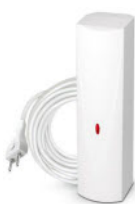
FD-1 Flood Detector