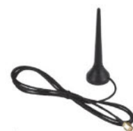
ANT 900/1800 GSM antenna